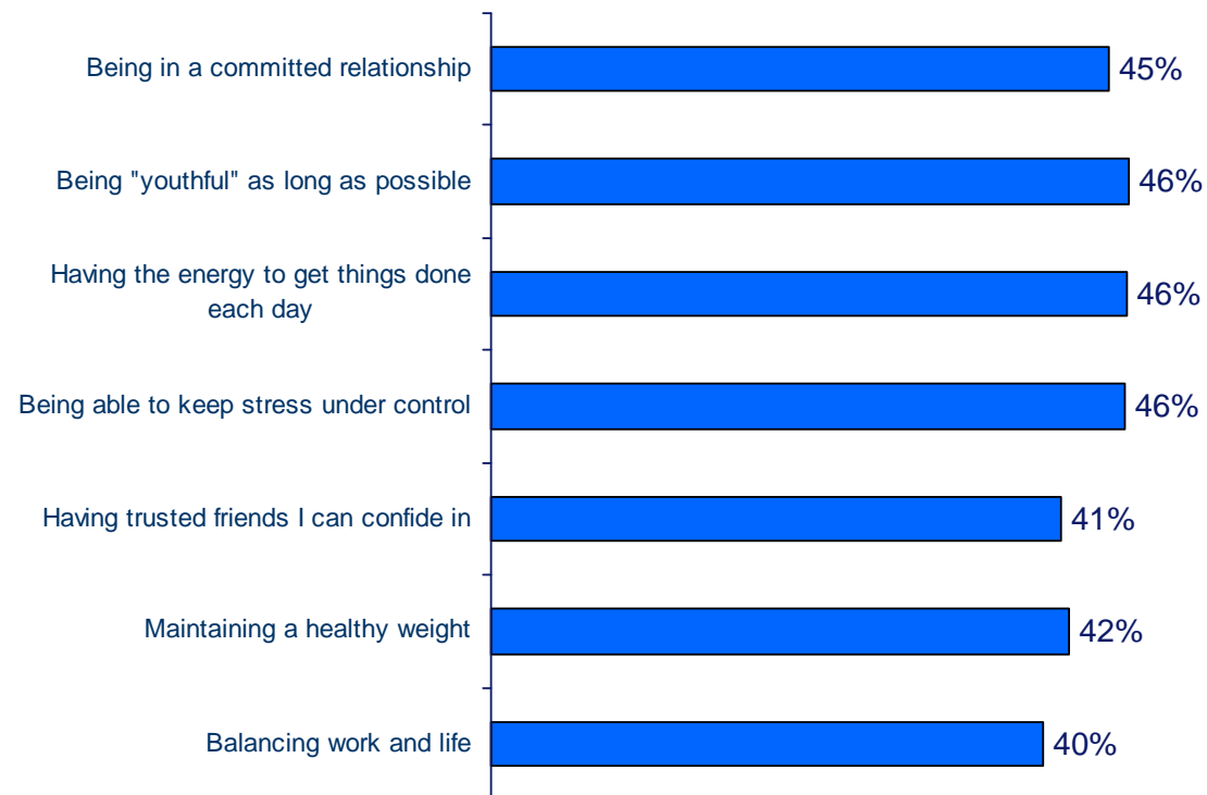
Percent Rating 10 out of 10 in Importance

Q. How important are the following to your sense of personal well-being?